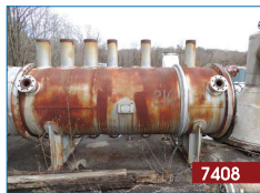
Unused Waste Heat Boiler