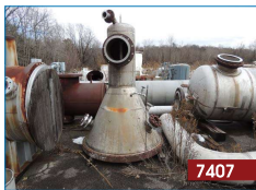
Ammonia Air Mixer