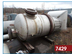
Tail Gas Interchanger