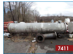
Unused Tail Gas Heater