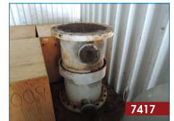
Tail Gas Preheater